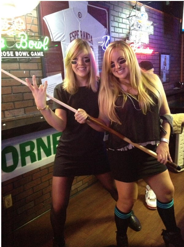
Black's Law "Babes"